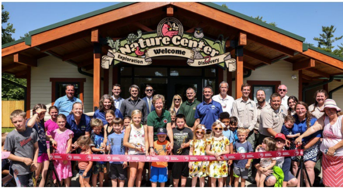
Nature center grand opening

Excitement and education are alive at the new nature center recently unveiled at Hueston Woods State Park .