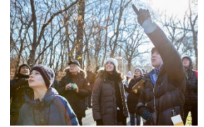
Bird Count Participants

Be a part of the National Audubon Society's 121st winter bird census, involving thousands of volunteers across the U.S., Canada, and other countries. AMV is responsible for the census in a 15-mile diameter circle around Oxford. Participants work in groups, so both experienced and inexperienced birders are welcome. Plan to stay for a pot-luck lunch after the count. Check audubonmv.org for more information.