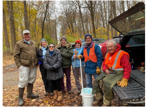
Volunteers at Hueston Woods volunteer day

This area of the preserve is designated as a local Important Bird Area (IBA). AMV adopted this IBA as a stewardship project in 2012. These woods are special because they are a small remnant of the mature Beech-Maple Forest that used to cover much of Ohio. The purpose of our work is to protect the diversity of the woodlands from invasive plants that crowd out the beautiful wildflowers that bloom in April, such as Spring beauty, Dutchman's breeches, and Trilliums, the native shrubs and understory trees such as Spicebush and Pawpaw, and the tree seedlings that regenerate the forest. Wildlife of all kinds, including nesting birds and migratory birds depend on this mature woodland habitat.